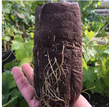
Protect your investment